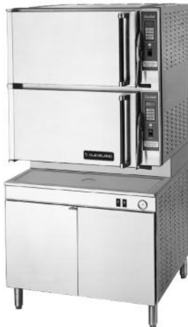
Shown with optional Electronic Timer