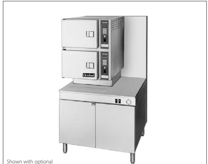
Shown with optional Electronic Timer