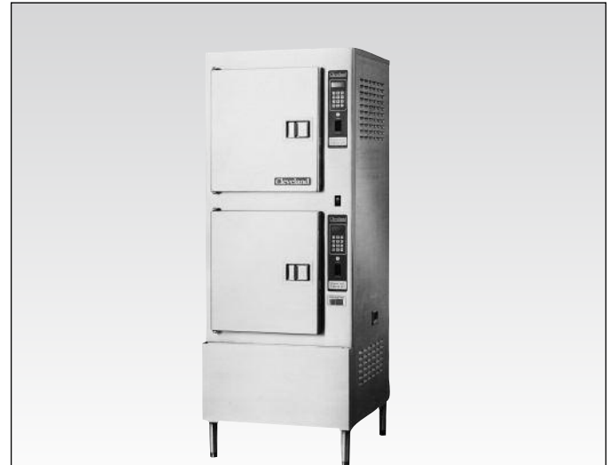
Shown with optional Electronic Timer