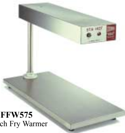
FFW575 French Fry Warmer

When customers come to your store or restaurant, two things are certain: they want their food hot and they want it to taste fresh.