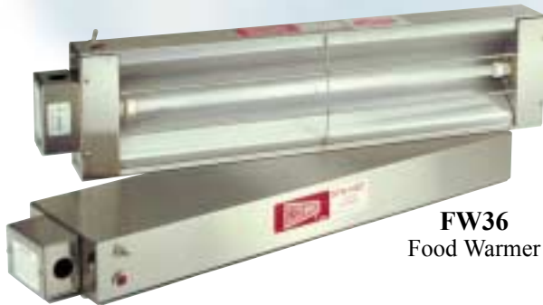
FW36 Food Warmer