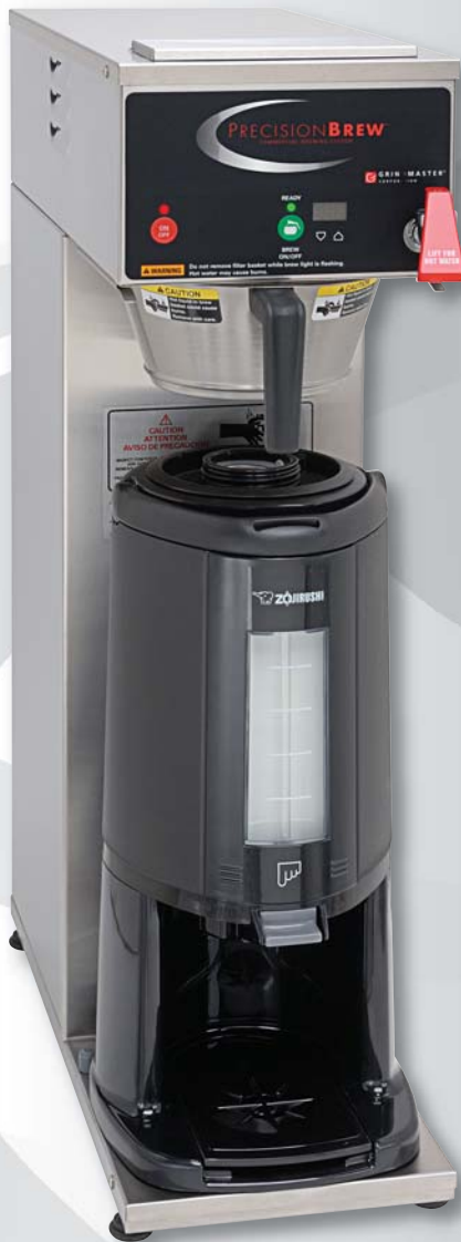
Model B-SGP (Container sold separately)

Digitally controlled gravity container brewer holds brew temperature to \pm 1^{\circ}\text{F} throughout brew cycle. Brew temperature, brew volume, operator defined pre-infusion/pulse brewing, and low temp/no brew are programmable from the front display.