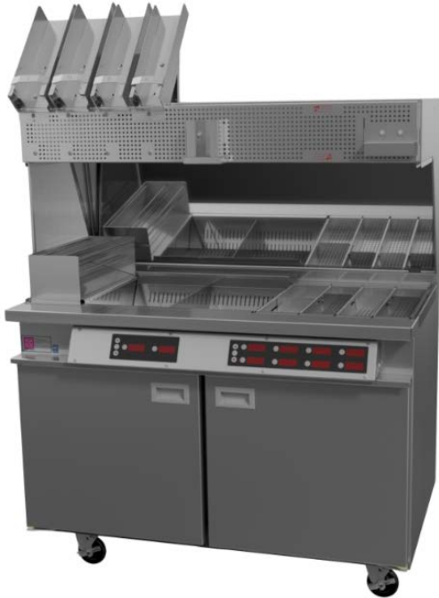
Model RR5-48.5LT (dump left shown)

The Marshall Models RR5-48.5 and RR5-42 Fry Dump Stations feature our ThermoGlo™ heating technology. Heat radiates from every square inch of the upper flat plate heating surface. This eliminates the need to clean intricate cal-rod, wire and reflector assemblies. There is also auxiliary bottom heat. This dump station includes four organizers and a fry dump pan with a bagged fry holder.