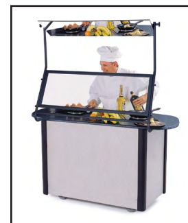
Optional food shield and demo mirror

Measurements in ( ) denote metric millimeters, unless otherwise specified.