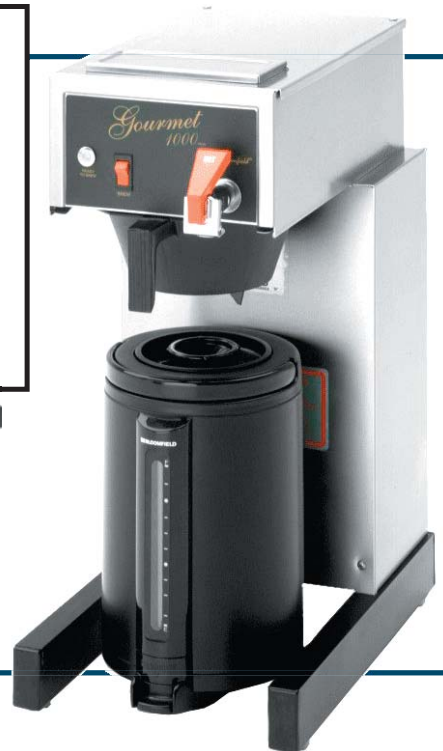
Model 8788/8782 shown with optional 7752