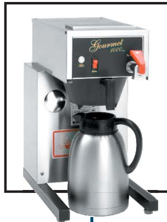
Model 8782XL shown with optional 7874

Airpot Coffee brewers offer volume brewing, proper extraction and holding capacity in a limited space. The 8782XL, at an extra low height of only 17 3/4", is sure to fit in those tight counters. These uniquely designed units eliminate flow control problems, and resist clogging in adverse water conditions. Coffee is brewed into a thermal server or airpot for easy transport to remote serving areas where the coffee will be preserved for optimal temperature and taste.