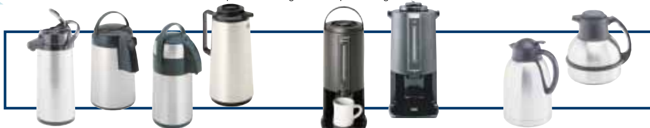
Complete line of Airpots for use with brewers with 13 3/8" clearance heights

ACCESSORIES: See the Bloomfield Brew Brew product catalog for a complete listing of brewers and accessories.