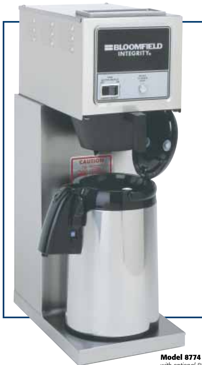
Model 8774 with optional 8881