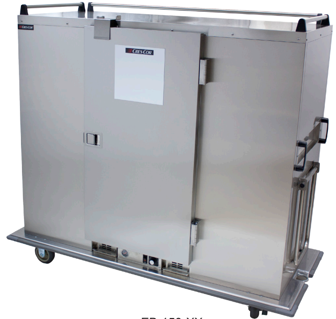
EB-150-XX (Shown with accessory options)