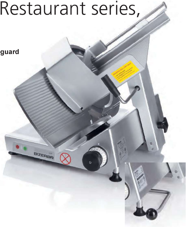
Side Lift arm, included