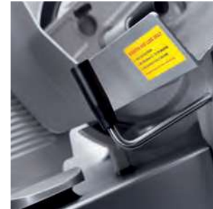
Remote sharpener, better food safety