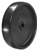
BT-W Solid Polyolefin Wheel