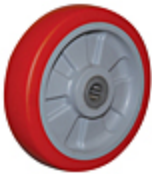
PP10 Moldon Polyurethane on Polypropylene Hub Wheel