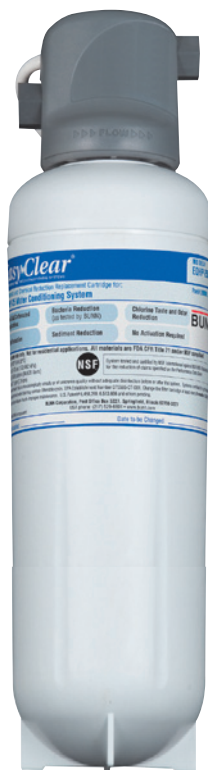
Model EQHP-35L Water Quality System