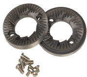
BURR SET KIT, NEW