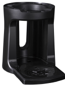
STAND ASSY, TF SERVER GEN3 Product #: 39795.0200