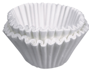
FILTERS, GOURMET 500 500/1 50/CL Product #: 20138.1000