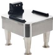
1SH STAND, 120V INF SERIES Product #: 27825.0200