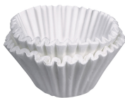
FILTERS, GOURMET 500 500/1 50/CL Product #: 20138.1000