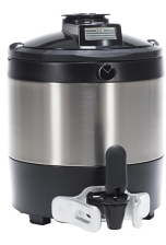
TF SERVER, 1G DSG NOBASE GEN3