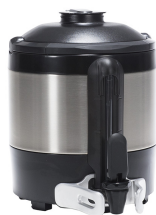
TF SERVER, 1G MECH NOBASE GEN3