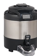
TF SERVER, DSG2 1G SST NOBASE