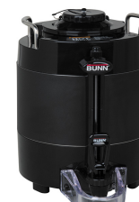
TF SERVER, 1G/3.8L MECH BLK NOBASE