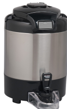
TF SERVER, DSG2 1.5G SST NOBAS