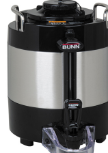
TF SERVER, 1G/3.8L MECH NOBASE