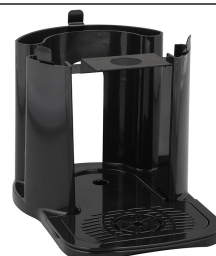
STAND ASSY, TF SERVER