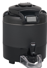
TF SERVER, DSG2 1G BLK NOBASE