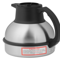
THERMAL CARAFE, ORN 1.9L 12PK