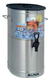
TDO-4, RESERVOIR BREW THRU