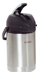
AIRPOT, 2.5L SST LA 6/ CASE