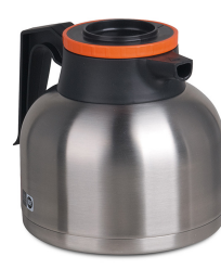
CARAFE, SST 1.9L SHRT ORN 12/