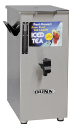
TD4T, W/ LIFT HANDLE