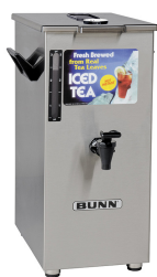
TD4T, BREW THRU LID NUDGER HDL