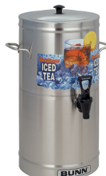
TDS-3, 3 GAL