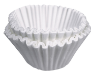
FILTERS TEA/SYS2 500PK/1 50/CL