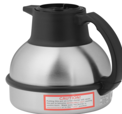
THERMAL CARAFE, BLK 1.9L 1PK