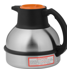
THERMAL CARAFE, ORN 1.9L 1PK