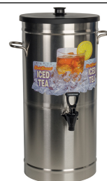
TDS-3.5, 3.5 GAL