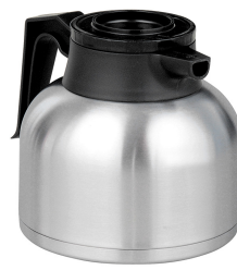
CARAFE, SST 1.9L SHRT BLK 12/