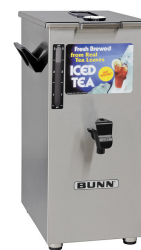
TD4T, W/BREW THRU LID & LIFT HANDLE