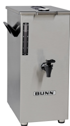
TD4T, BREW THRU LID NO DECAL NUDGER HDL