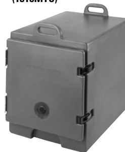
For Camcarriers (300MPC)