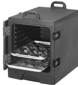
For Camcarriers (1318MTC)