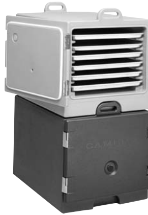
For Camcarrier 1826MTC (Camcarrier for Trays & Sheet Pans)