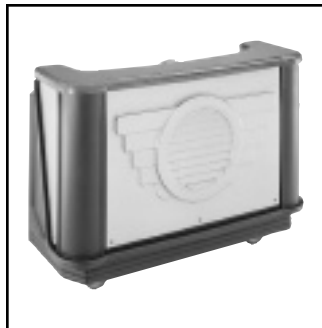
Manhattan Decor Combination (667)