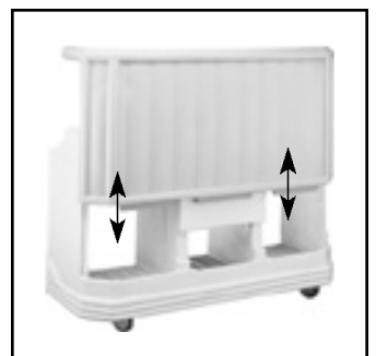
Detachable front for easy access to inventory and routing lines, tubes and hoses.