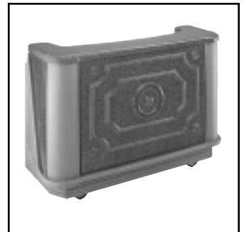
Carmel Decor Combination (669)