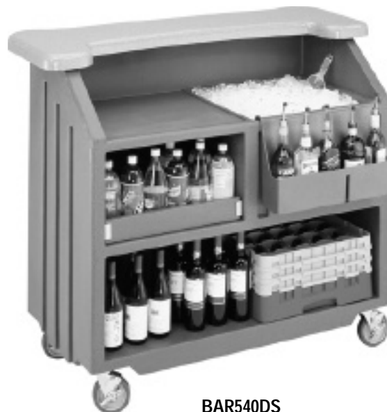
BAR540DS (Shown with 5-bottle Speed Rail)