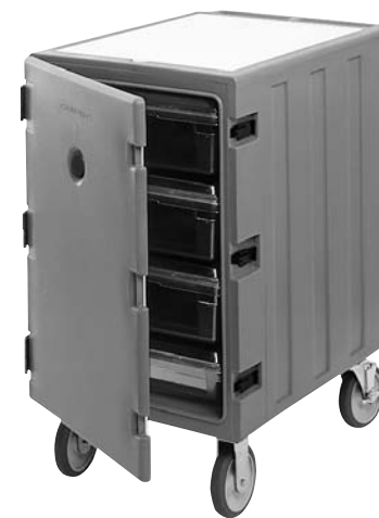
1826LBC (For Food Storage Boxes)