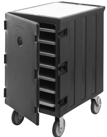
1826LTC3 (For Trays & Sheet Pans)