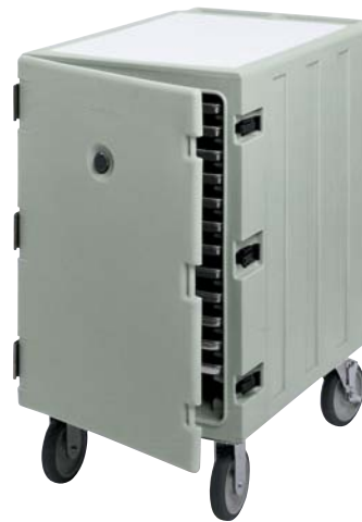
1826LTC (For Trays & Sheet Pans)