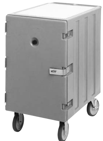
1826LBCSP (With Security Package)