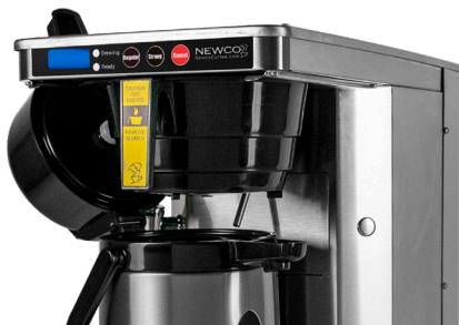
Standard Brew Basket

Set-up on the 20:1 Brewing system is easy. Simply plug in the water supply, plug in the system's built in cord, and turn the machine on. The 20:1 system will sense a dry probe and begin filling the tank automatically. Once the water in the tank has reached the proper level, the tank heater will automatically turn on and begin heating. In minutes, the correct brewing temperature will be reached, and you're ready to brew!