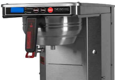
Optional Gourmet Funnel