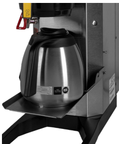
Optional Drop Down Tray