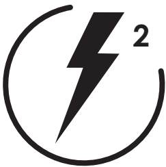
Optional Dual Voltage