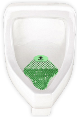
Fold Lines for Compact Urinals

Most urinal screens are displaced around the urinal after each flush, the Stingray with its Tether Tab stays in place for effectiveness & a cleaner look