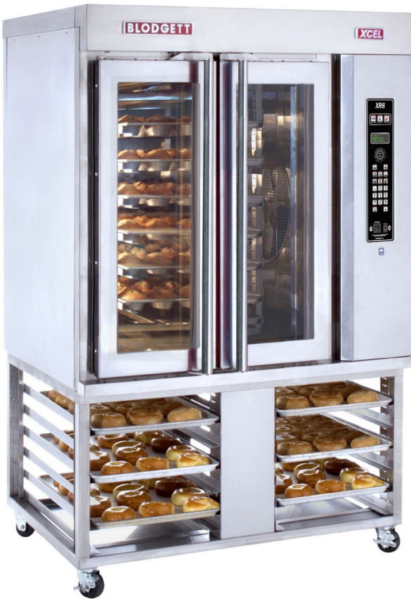
XR8-E with 12 pan stand

Project _____ Item No. _____ Quantity _____