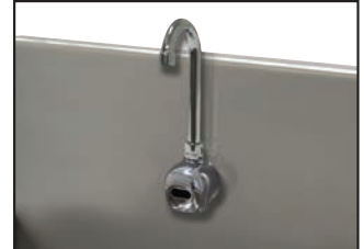
Hands-Free Electronic Faucet