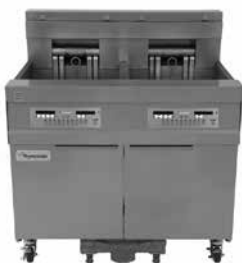
Model Shown: 21814E with optional filtration

41814EF 11814E/RE17/11814E (with filter)