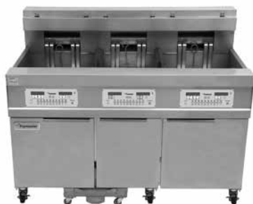
Model Shown: 11814E/RE17/11814E