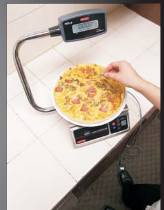
Foot tare pedal

Ideal for Pizzerias Industrial Kitchens Restaurants Etc.