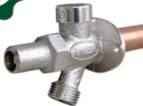
C-244 Loose Key Design