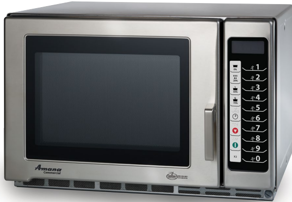
Model RFS12TS shown