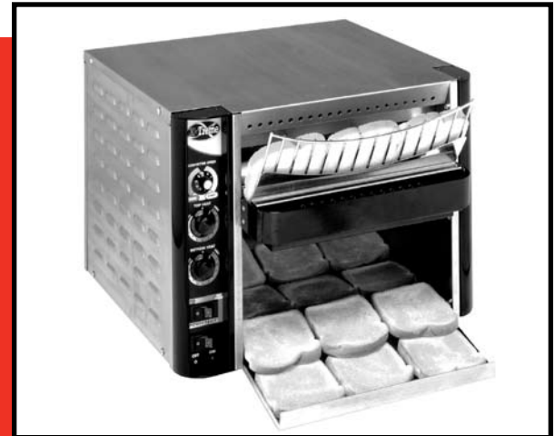
X*TREME-3™ RADIANT CONVEYOR TOASTER

See reverse side for product specifications.