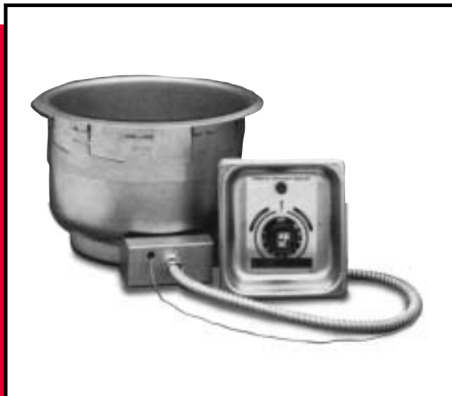
MODEL SM-50-11D UL HOT FOOD WELL