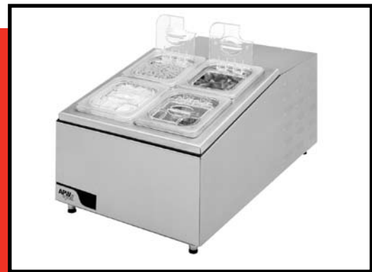
RTR-4 Refrigerated Topping Rail