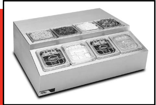
RTR-8 Refrigerated Topping Rail