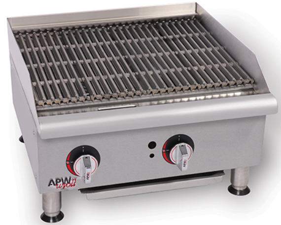
Model GCRB-24i Gas CharRock CharBroiler