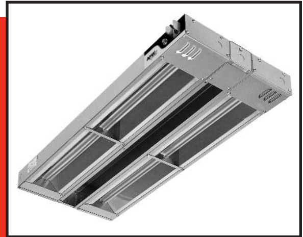
FDD SERIES OVERHEAD WARMERS