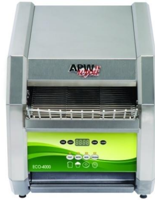
Model ECO 4000 350E

*Warranty does not include rock grates, cooking grates, burners shields or fireboxes.