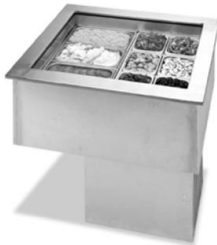
Model: Drop-In Cold Well