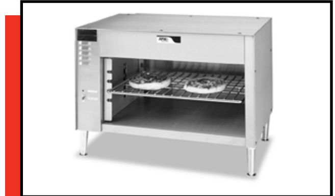
MODEL CDC-24 SHOWN