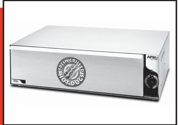
BUN WARMER MODEL BW-20