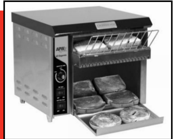
AT EXPRESS RADIANT CONVEYOR TOASTER