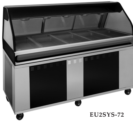
EU2SYS-72 FRONT VIEW SHOWN WITH OPTIONAL CASTERS