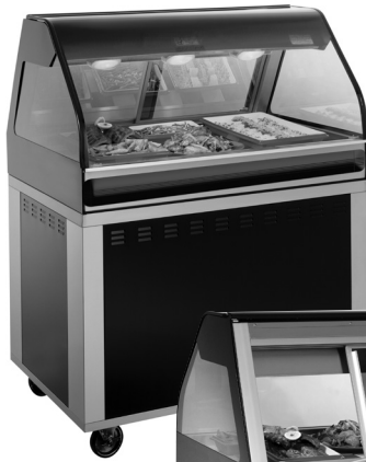
EU2SYS-48 FRONT VIEW SHOWN WITH OPTIONAL CASTERS