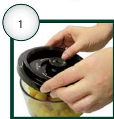
Close Canister Lid