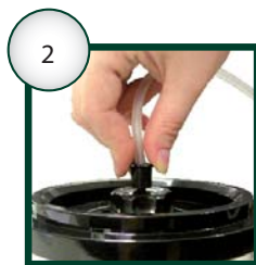
Insert Vacuum Hose and Vacuum