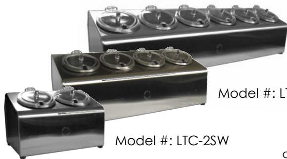
Model #: LTC-6SW