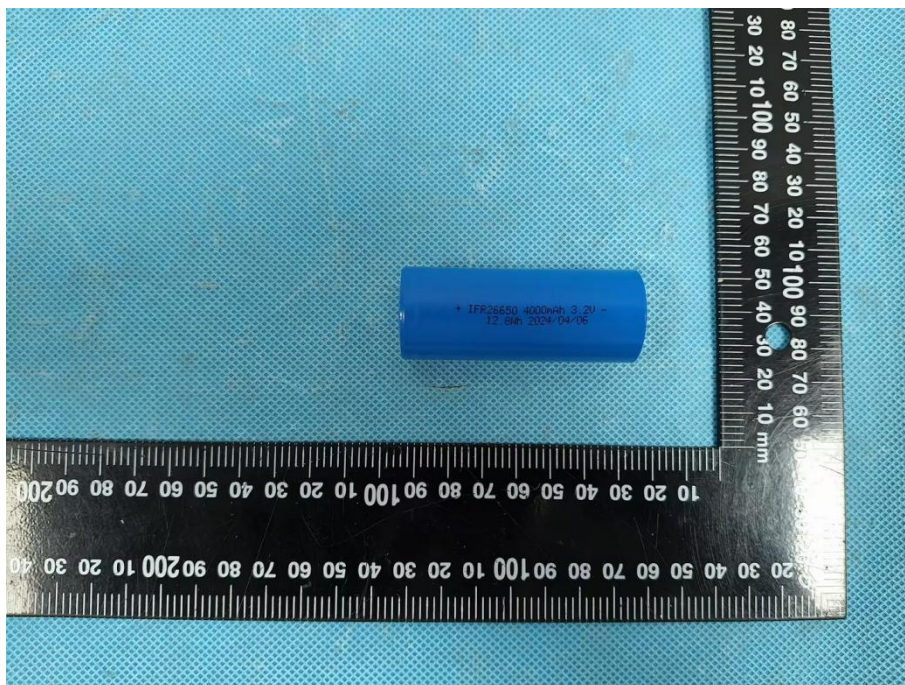
Photo 4 电池正面 Front view of Cell