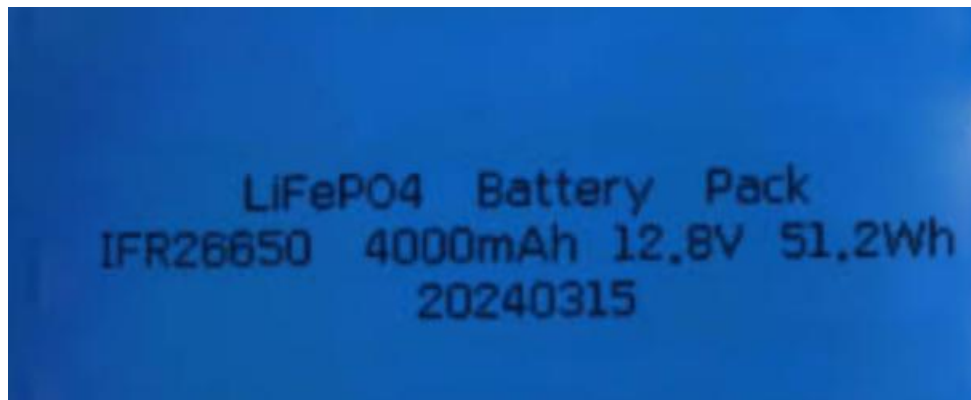
Photo 3 标签特写 Label close-up