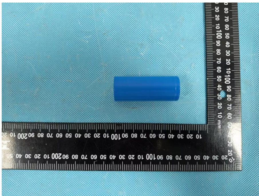
Photo 5 电池背面 Back view of Cell