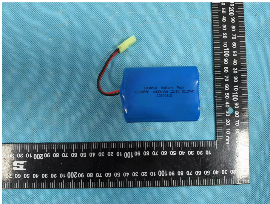
Photo 1 电池组正面 Front view of battery