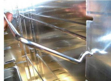
GRASP THE RUNNER AS SHOWN IN THE PHOTOS BELOW.

RUNNERS MUST BE REMOVED WITH A 4" MINIMUM SPACE ABOVE THEM TO REMOVE A RUNNER