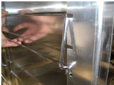
TILT THE RUNNER UP AND ENGAGE BOTH ENDS TOGETHER. DO NOT HAVE ONE SIDE ENGAGED LESS THAN THE OTHER.