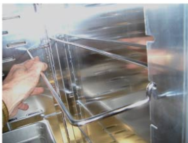
WHEN IN THE CORRECT POSITION THE RUNNER WILL BE AT 90 DEGREES TO THE SIDE OF THE CABINET.

RUNNERS MUST BE REMOVED WITH A 4" MINIMUM SPACE ABOVE THEM TO REMOVE A RUNNER