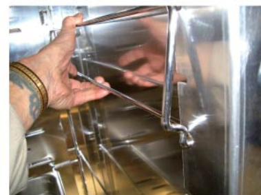
KEEP TILTING UNTIL THE RUNNER TOUCHES THE SLOTTED SIDE OF THE CABINET AND WITH BOTH ENDS OF THE RUNNER EQUAL DISTANT FROM THE CABINET SIDE. THE RUNNER WILL SLIDE OUT EASILY. DO NOT FORCE IT.