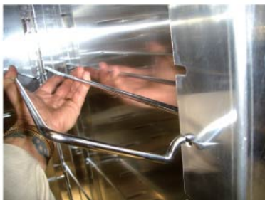
ROTATE THE RUNNER DOWN APPLYING A SLIGHT FORCE INWARD AGAINST THE RUNNER AND CABINET. DO NOT FORCE IT.