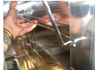
TILT THE RUNNER UP SLOWLY WHILE PULLING THE RUNNER OUTWARD AWAY FROM THE SIDE OF THE CABINET. DO NOT FORCE IT. ASSURE BOTH SIDES ARE IN THE SAME POSITION AS YOU ARE LIFTING THE RUNNER.