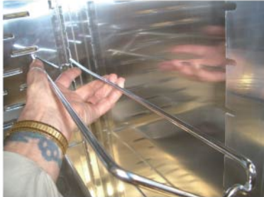
GRASP THE RUNNER AS SHOWN IN THE PHOTOS.

RUNNERS MUST BE ASSEMBLED WITH A 4" MINIMUM SPACE ABOVE TO ASSEMBLE THE RUNNER