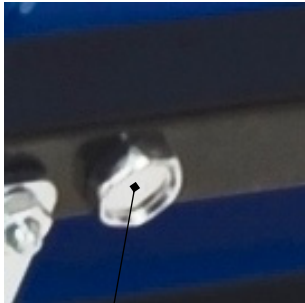
FIG. 1A: Attach carriage to bin

Step 2: Fasten the carriage to the underside of the bin at the four locations highlighted with light-colored arrows below. To attach the carriage to the bin, use the 4 large hex head screws provided with the product. Insert the screws through slots in the cross rails of the undercarriage and into the bin as shown in FIGS. 1A & 1B.